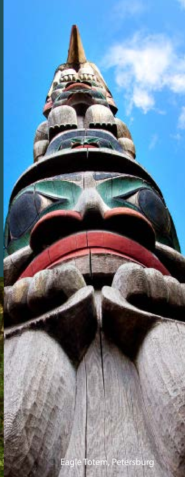
Eagle Totem, Petersburg