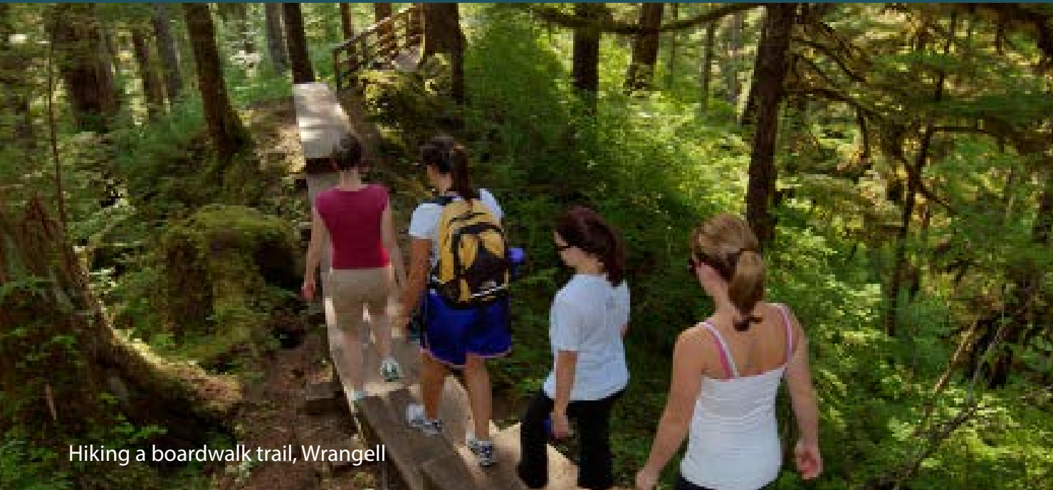
Hiking a boardwalk trail, Wrangell

Get to know Wrangell Bearfest – A five day festival the third week of July celebrating the Bears of Alaska through fun safety and educational activities. Events include a Bear Symposium with interactive discussions by renowned bear researchers and bear viewing site managers across the country, safety workshops if encountering bears, photo workshops, kid games, live music, and a qualifying marathon. And center stage for the event are trips to Anan Bear and Wildlife Observatory, an hour by boat from Wrangell, that hosts black and brown bears July through August feasting on pink salmon.